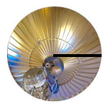
High Gain Antenna